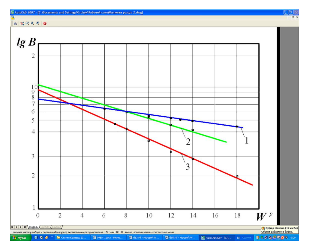
Fig.2 Dependence lgB = f(W^P) for coal grades Note: 1 – T of the Donetsk basin; 2 – G of the Lviv-Volyn basin; 3 – AK of the Donetsk basin.

impact of various options for introducing water into the solid fuel combustion zone on the quality of combustion and its ecological and economic level for one value. The first role in ensuring the efficiency of boiler installations at thermal power plants and in the process of preparation for burning solid fuel is played by the professionalism of the staff and timely diagnostics of the equipment. To reduce the emission of fuel oxides of nitrogen, it is necessary to start the process of burning solid fuel with excess air, which is equal to the release of volatile substances.